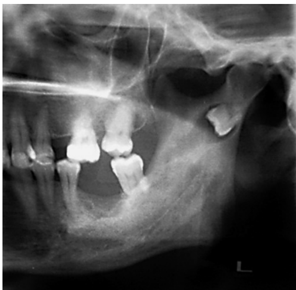
Fig. 1. Panoramic radiograph showing an inverted third molar associated with a radiolucent image in the left subcondylar region.

The new clinical case reported here was a 53 years-old woman who had suffered several episodes of intense pain and swelling in the left preauricular region accompanied by trismus, during the last year. The panoramic radiograph (Fig. 1) showed an ectopic third molar in